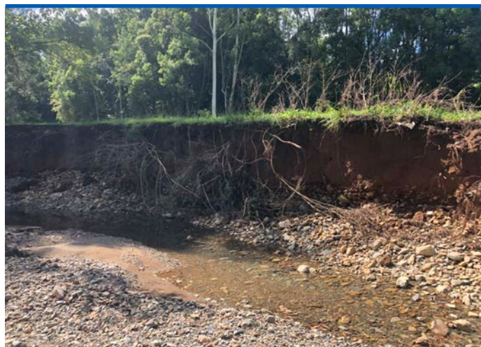
Image: Erosion is accelerated without vegetation to hold the soil together.

Riverbanks can quickly lose their integrity once soil is eroded and washed away. Once soil is removed and the banks begin to steepen, soil not held in place by a variety of roots will erode quickly during a flood event.