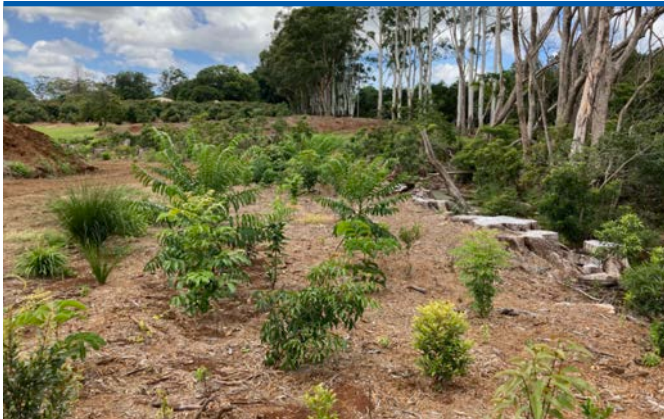
Image: A narrow riparian zone should be widened to properly protect the riverbank from erosion.

Recovery options will vary depending on the size of the riverbanks and gullies, the amount of damage, and previous management of the riverbank and riparian zone. Effective erosion recovery and ongoing management ensures beds and banks are better protected against future floods, which should result in less damage.