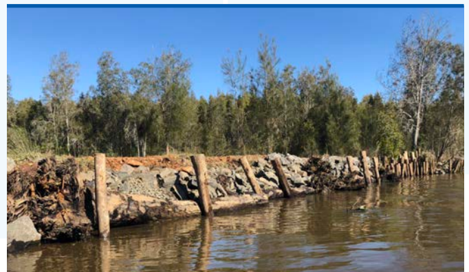
Image: Remediation ideally includes additional features like snags to promote aquatic habitat.

The Soil Conservation Service is a unit of Local Land Services with a long history in providing practical natural resource management solutions. The Soil Conservation Service can provide services including design, costing and approvals, through to managing project construction and engaging local contractors. For more information on its services, head to the Soil Conservation Service website www.scs.nsw.gov.au